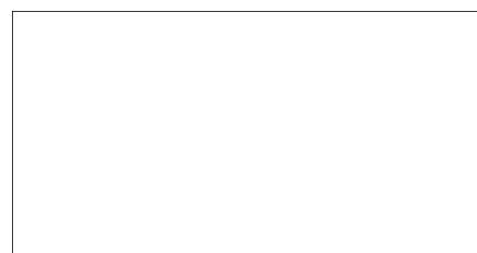
Lift Sheet 50-LFT001